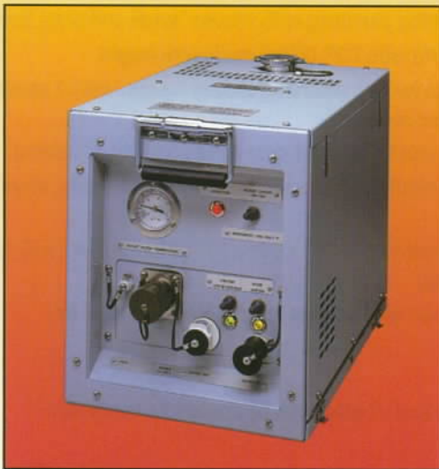
MF2705 WATER HEATER