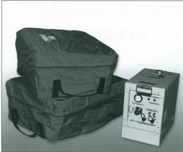
Shower Shelter and Heater shown in transport configuration.

The simple to operate system burns fuel to heat water and uses DC power from a vehicle to run the shower pump and controls.